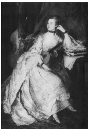
Thomas Gainsborough, Ann Ford , 1760